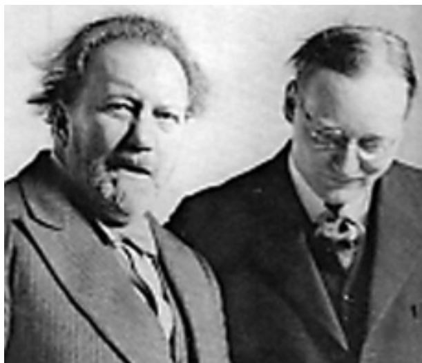
Percy and Sir Henry Wood, Bournemouth. 1938

Whitlock excels himself in the opening movement and it's hard to think of a finer concert allegro for the organ. The energy is breathless and it sweeps along to its final triumphant conclusion.